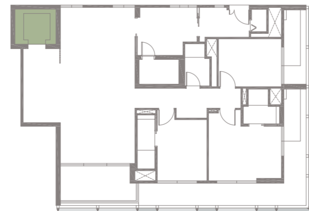
LEVEL 4 TYPE 3B.4