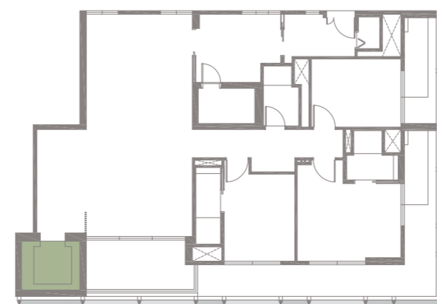
LEVEL 5 TYPE 3B.5