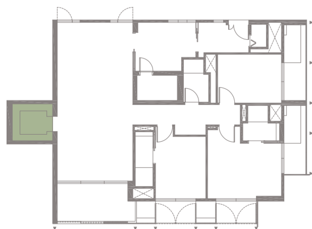
LEVEL 1 TYPE 3B.1